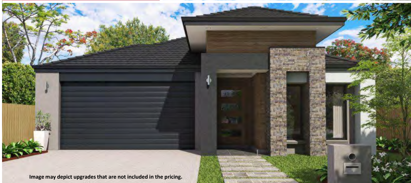
Image may depict upgrades that are not included in the pricing.

Floor area: 207.29m 2 / 22.31sq | Block size: 537m 2 Address: Lot 213 Macadamia Circuit, Medowie